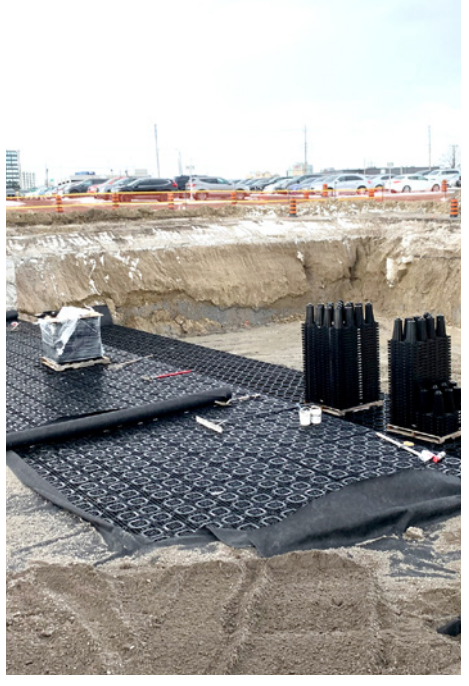
Tank with Parking Lot in Background