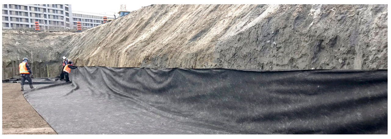
Excavation and geotextile at nearly 5m deep