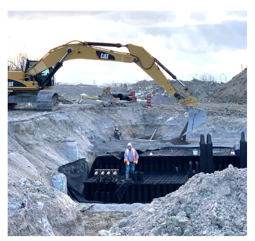
Backfilling stone on top of partially completed tank